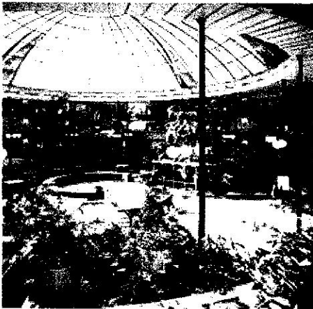
(View of Atrium & Pool)

NOTE: All reservations must be received by June 14th as Iris will be leaving for Iowa by then.