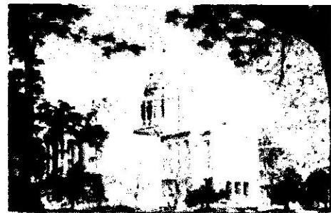
Iowa State Capital Building Des Moines, Iowa

For those who want to do some site seeing, the Iowa State Capitol is open for tours - 515 281-5591.