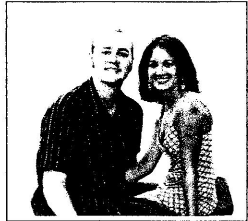
Newly Weds at Lake Como, Italy